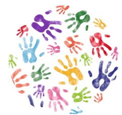
Children's Legal Center

Children's Legal Center (CLC) works to provide trauma-informed support to victimized children and families through direct legal and non-legal services. Created in June 2018, CLC's founding attorneys recognized the growing need for free immigration legal services, especially for children and victims of violence. CLC provides immigration relief screenings for eligibility and direct legal services to undocumented children and families who have experienced victimization. CLC's services include representation before the Immigration Court for asylum seekers and unaccompanied minors, as well as undocumented victims.